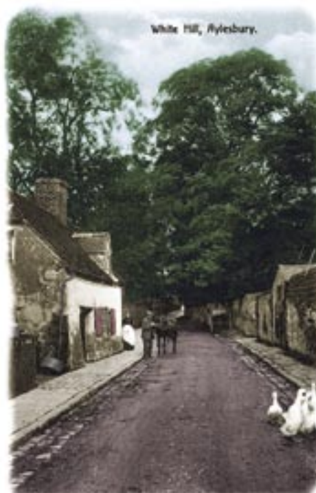
Ducks on White Hill, Aylesbury in 1901