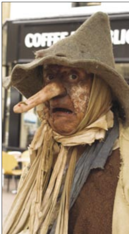
Singing Plague victim from last year's Tudor Fayre.