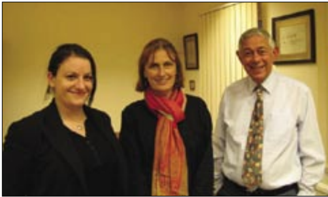
Current ATA members