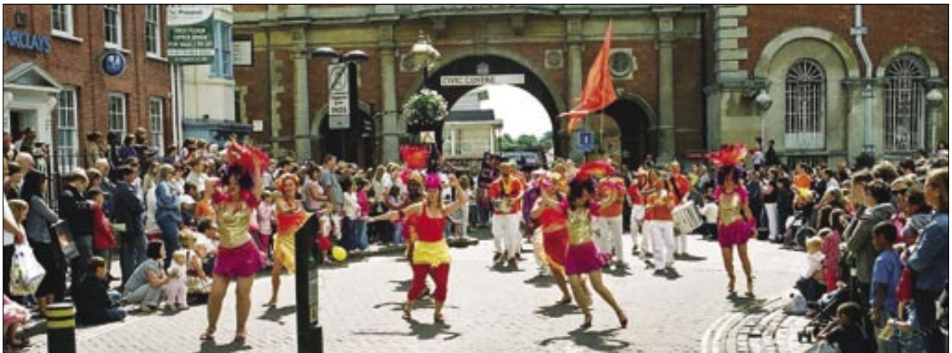
Dancers in Roald Dahl Parade