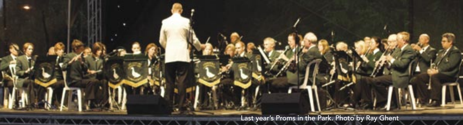
Last year's Proms in the Park.