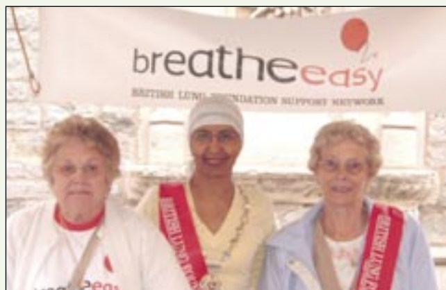
Our Deputy Mayor at the Breathe Easy Charity Event