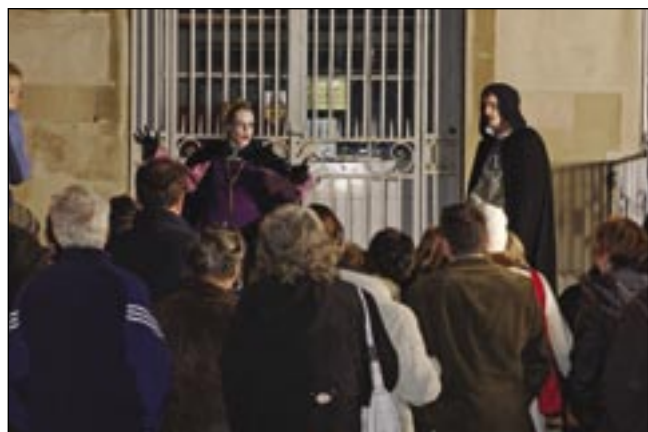
Last year's Ghouls and Villains tour.