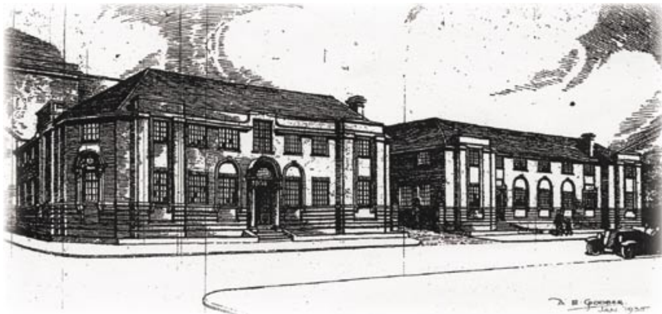
The above drawing was specially prepared for The Bucks Herald illustrating the new Aylesbury police station and constabulary headquarters at the junction of Walton Street and Exchange Street Aylesbury.

After the opening ceremony the guests were able to witness the despatching of a message by the aid of the teleprinter from Sir Walter Carlile to the whole of the police in the county, in which he said that in no county in England did there exist a Police Force more united, more efficient, more happy and contented or more loyal to its best traditions.