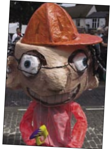
Puppet from Roald Dahl Parade

The Roald Dahl Festival in conjunction with AVDC opened the event and a great day was had by participants and onlookers alike.