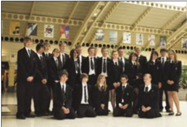
Waddesdon C of E School in Friars Square Shopping Centre

On 6th July despite a change for the worse in the weather, sports clubs from Aylesbury attended 'Sport Sunday' to promote their organisations. All clubs reported a successful recruiting campaign, with the Aylesbury Ladies Hockey Club finding five new members. See the next edition of Aylesbury Town Matters for a full report on the Aylesbury Festival '08.