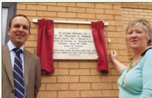
The Mayor re-dedicating the TA Centre at Viney House