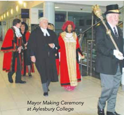
Mayor Making Ceremony at Aylesbury College