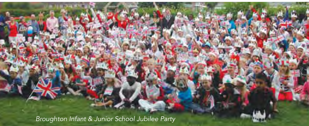
Broughton Infant & Junior School Jubilee Party