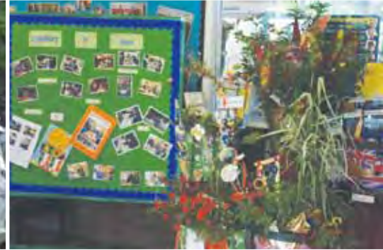
Stocklake School - Best Garden in a Pot