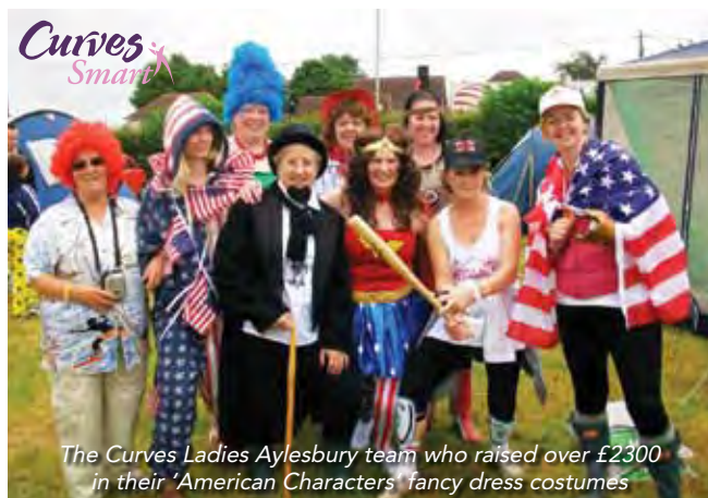
The Curves Ladies Aylesbury team who raised over £2300 in their 'American Characters' fancy dress costumes