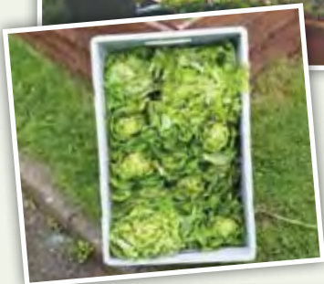
Pebble Brook School - Best Learning Garden and Overall Winner of Aylesbury in Bloom - Schools.