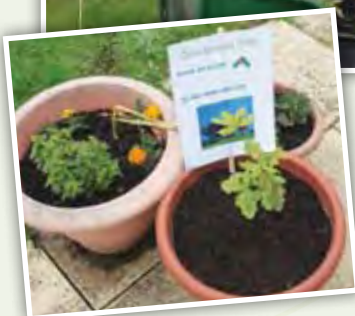
Oak Green School - Best Children's Gardening Club and 1st Prize for Environmentally Friendly Nature Area

The Town Council's gardening competition, Aylesbury in Bloom, was held again this year and against the odds many residents and schools produced beautiful gardens to impress the judges.