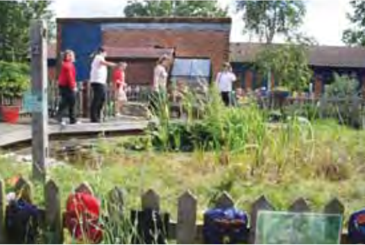
Turnfurlong Junior School - 1st Prize in the Vegetable Garden Category