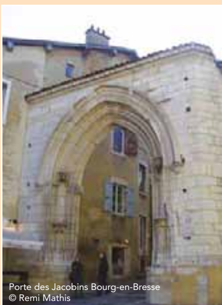
Porte des Jacobins Bourg-en-Bresse