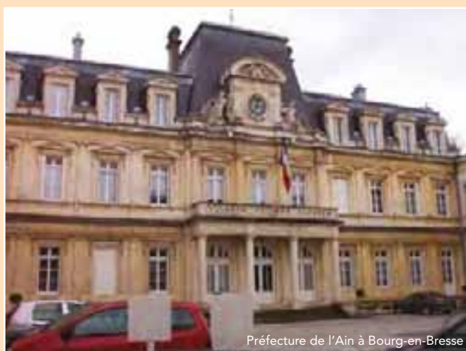
Préfecture de l'Ain à Bourg-en-Bresse

If you are interested in membership or would simply like to find out more about twinning activities, email: aylesburytowntwinning@gmail.com