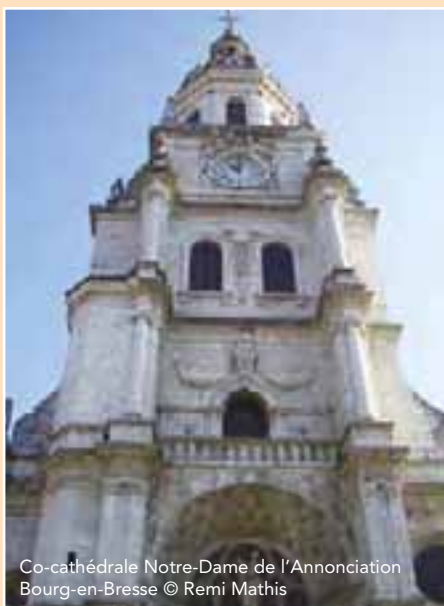
Co-cathédrale Notre-Dame de l'Annonciation Bourg-en-Bresse

In 2013, our twin ties with Bourg-en-Bresse grew even stronger with the partnership of Turnfurlong Junior School and Notre Dame School. The schools started exchanging videos and greetings before enthusiastically developing further links. On 12 June, forty French children from