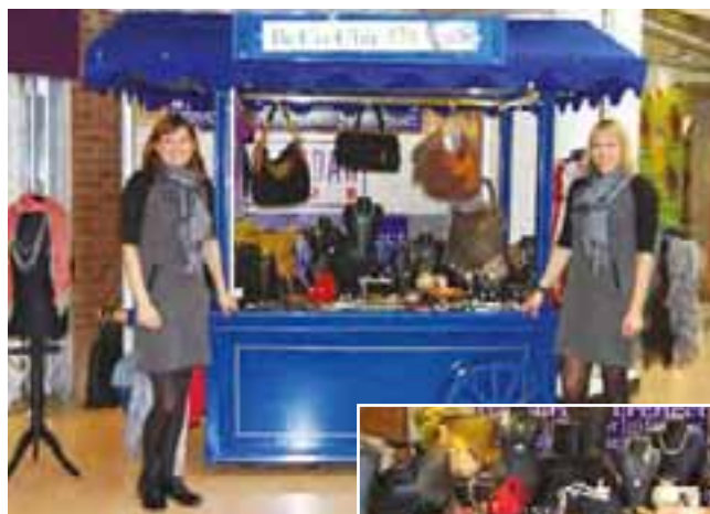
BeCo Chic Accessories