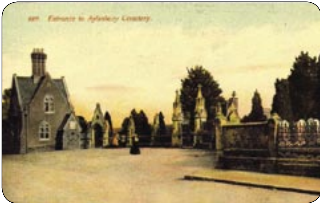
Aylesbury Cemetery c 1900