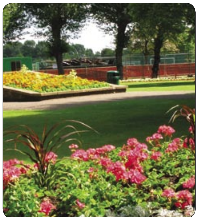
Vale Park.

You too can do your bit to make Aylesbury more beautiful by using the bins provided for the disposal of litter and cigarette stubs.