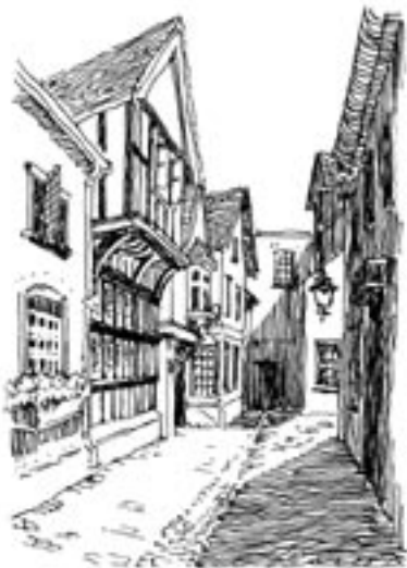
Sketch by Nick Carter, courtesy of the Aylesbury Society

'Probably one of the nicest inns in Aylesbury with a great open courtyard'; 'By far and away the best pub in Aylesbury'; 'Excellent house in interesting & historic building, with excellent beers'; 'I have been impressed with this place'; 'beer and food are both excellent'; 'a relaxed atmosphere prevails'. These are just some of the comments on various blog websites, and they sum up people's feelings about the King's Head. It holds a special place in the history of Aylesbury and both are intertwined. Nowadays it is also more than just a pub. The Tourist Office, a coffee shop also selling secondhand books, and a florist can all be found off the Courtyard.