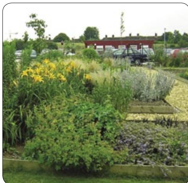
Gardens at Aylesbury College cultivated by students

In the future it is hoped that a programme of work placements can be created that will allow students to work with the Town Council's ground force.