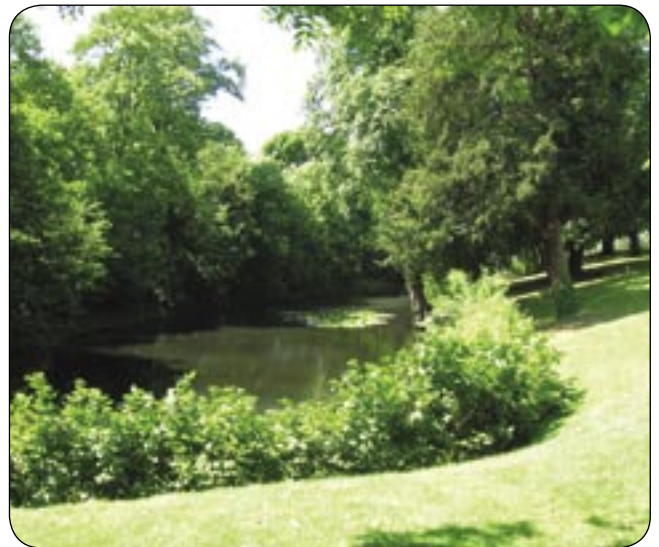
Old House Grounds.

So why not pick up a form from the Town Council Office at 5 Church Street, Aylesbury (next door to the County Museum) or telephone: 01296 425678 or visit www.aylesburytowncouncil.gov.uk Fax your entry to 01296 426134 or e-mail: info@aylesburytowncouncil.gov.uk