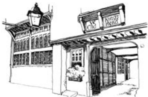
Sketch by Nick Carter, courtesy of the Aylesbury Society

By the late 15th century Verney had extended the Great Hall with a parlour, a secret room above and a kitchen. With the addition of the first gatehouse and stable accommodation, the area around the Courtyard was complete. Traces of the past can still be seen in the courtyard today: an 18th Century mounting block, a lamp holder for burning rags, hooks for unloading meat (which was used until the early 20th century), and some original cobbles. The old hotel reception office was originally used as an early Post Office. The stables, which are the only remaining example in Aylesbury, were built in the early 19th century replacing the 16th century originals. They were nearly destroyed in the 1930s to provide space for garaging, but fortunately survived.