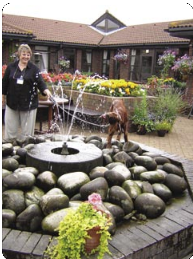
Florence Nightingale Hospice